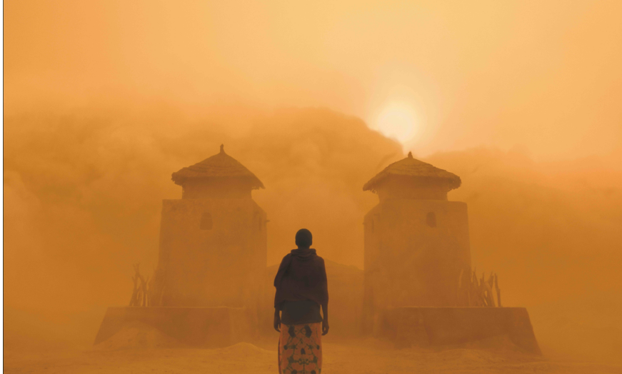
Ramata-Toulaye Sy, Banel & Adama , 2023. Film Still.

On view during the Venice Biennale, Your ghosts are mine: Expanded Cinemas, Amplified Voices highlights works by more than 40 filmmakers and video artists On view at ACP–Palazzo Franchetti from 19 April through 24 November 2024